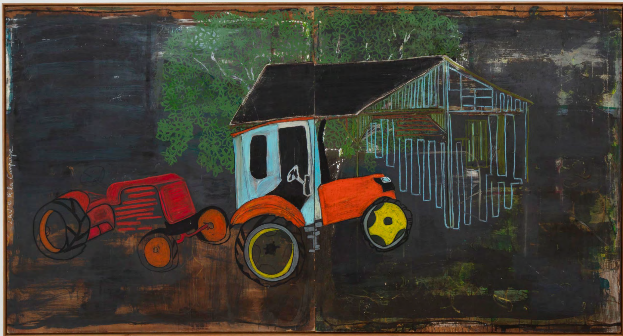
Installation shot of Aicha Khorchid's exhibition Les choses de la vie (the things of life) at GNYP Berlin in 2025