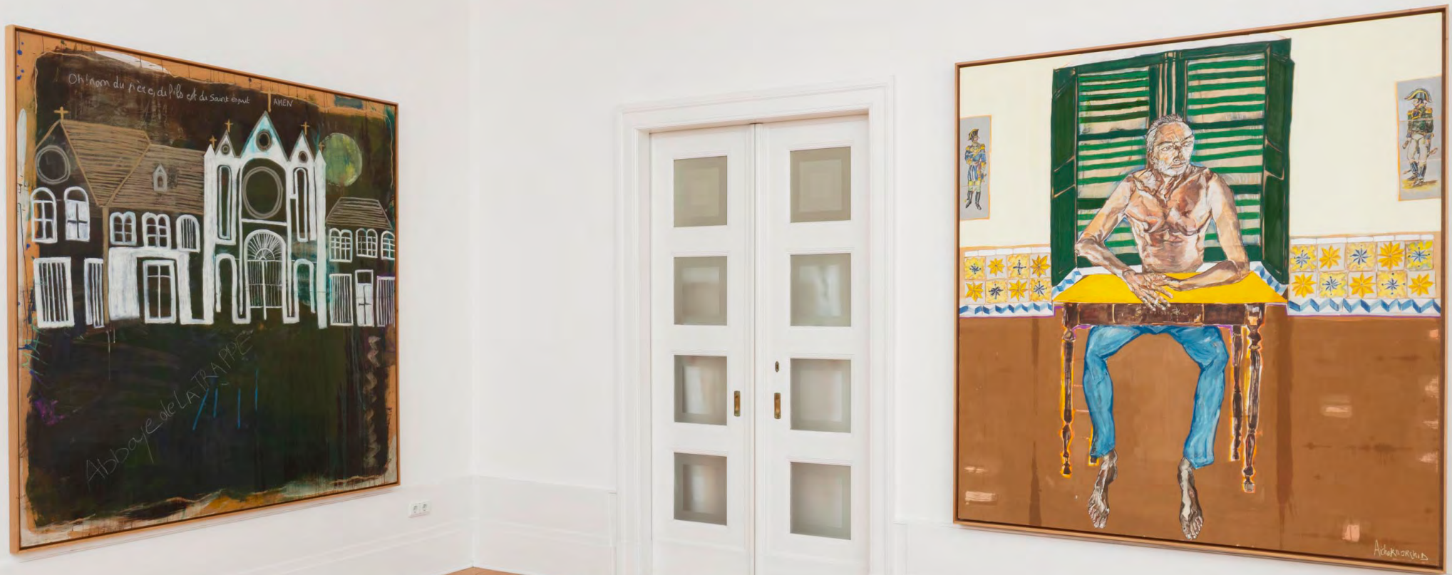
Installation shot of Aicha Khorchid's exhibition Les choses de la vie (the things of life) at GNYP Berlin in 2025