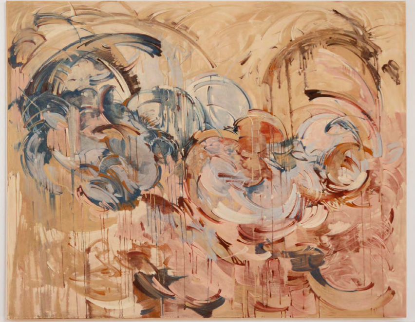
Installation view: Kaifan Wang, Wade Through Until the Waters Blue solo exhibition at GNYP Gallery, Berlin in 2024