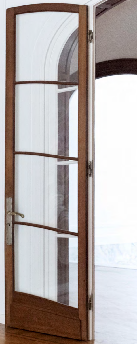
Installation view: Kaifan Wang, Is the spot on the neck bitten by mosquitoes? solo exhibition at GNYP Gallery, Amsterdam in 2023