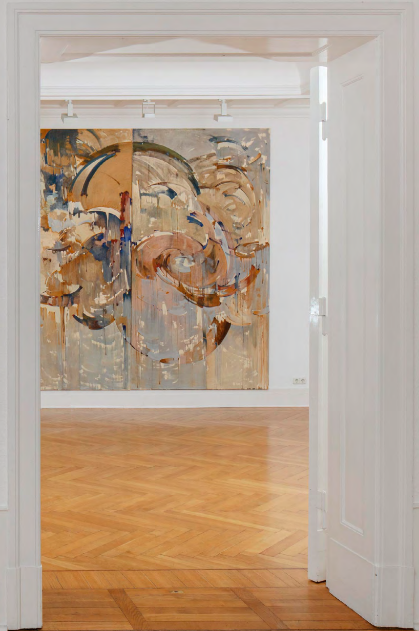
Installation view: Kaifan Wang, Wade Through Until the Waters Blue solo exhibition at GNYP Gallery, Berlin in 2024