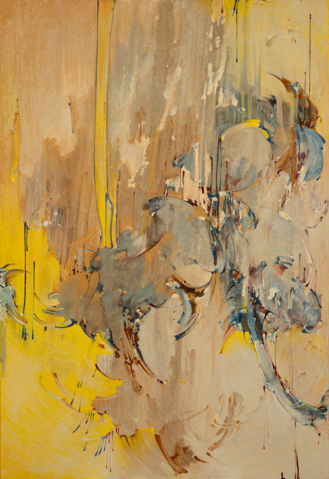
Kaifan Wang Reverse Mountain 2024