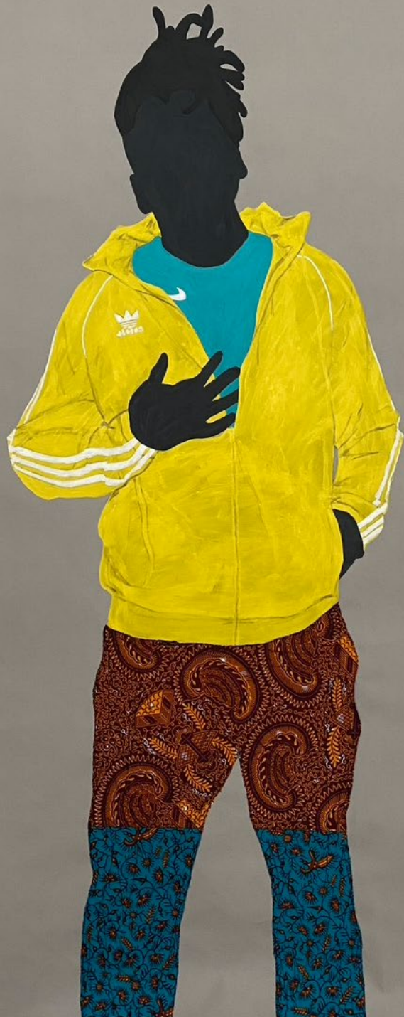
Raphael Mayne Through The Mirror 2020

acrylic, collage, and African wax print on canvas